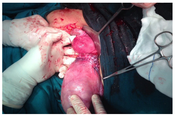
Figure 2. Intra operative image showing small non-gravid uterus on the left side adjacent to lower segment incision on the right uterus