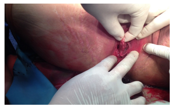
Figure 1. Longitudinal vaginal septum with two vaginal opening

Emergency cesarean section under spinal anaesthesia was performed and a live male baby weighing 3.960 kg was delivered at 21:40:35 hours on 4<sup>th</sup> May, 2019 with APGAR score of 7/10 and 9/10 at 1 minutes and 5 minutes of life respectively. There were two uteruses with pregnancy on the left horn (Figure 5). Noted moderate meconium stained amniotic fluid. Both the mother and newborn had an uneventful post-operative recovery and discharged home on 3<sup>rd</sup> postoperative day. Done postpartum ultrasound KUB and X Ray KUB, which did not reveal any abnormality in the kidneys, ureters and bladder.