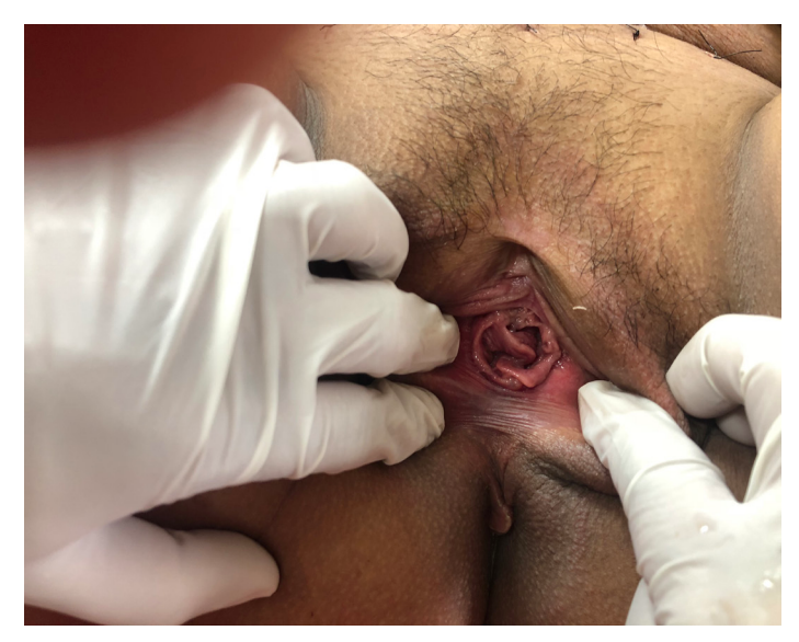
Figure 4. Longitudinal Vaginal septum