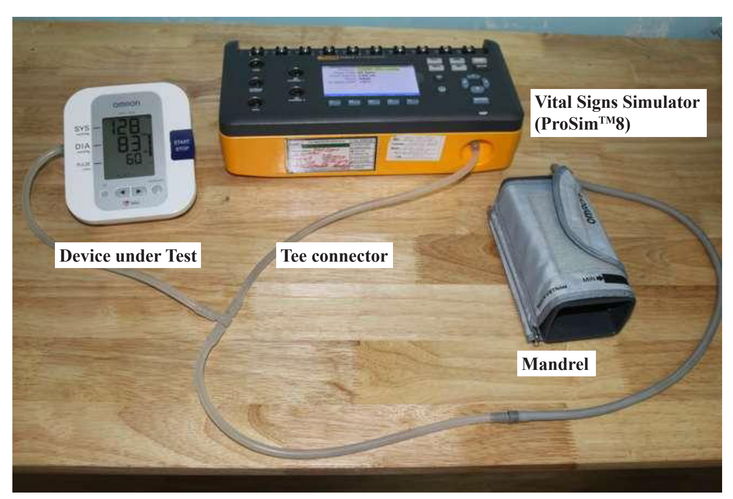
Figure 1. Set up of Blood Pressure Measuring Device for Pulse accuracy and leak tests with Vital Signs Simulator (ProSimTM8), in health facilities of Bhutan, 2018 as per the standard operating procedure for performance verification and safety testing of blood pressure approved by the Ministry of Health for use in Bhutan

<sup>†</sup>The permissible range as specified in the standard operating procedure for performance verification and safety testing of blood pressure approved by the Ministry of Health for use in Bhutan