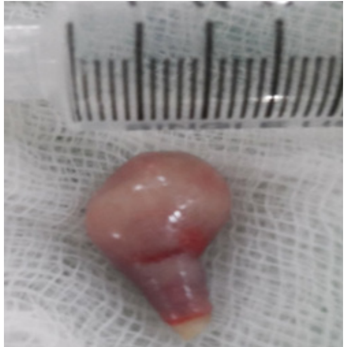
Figure 2. Angiofibrolipoma after excision