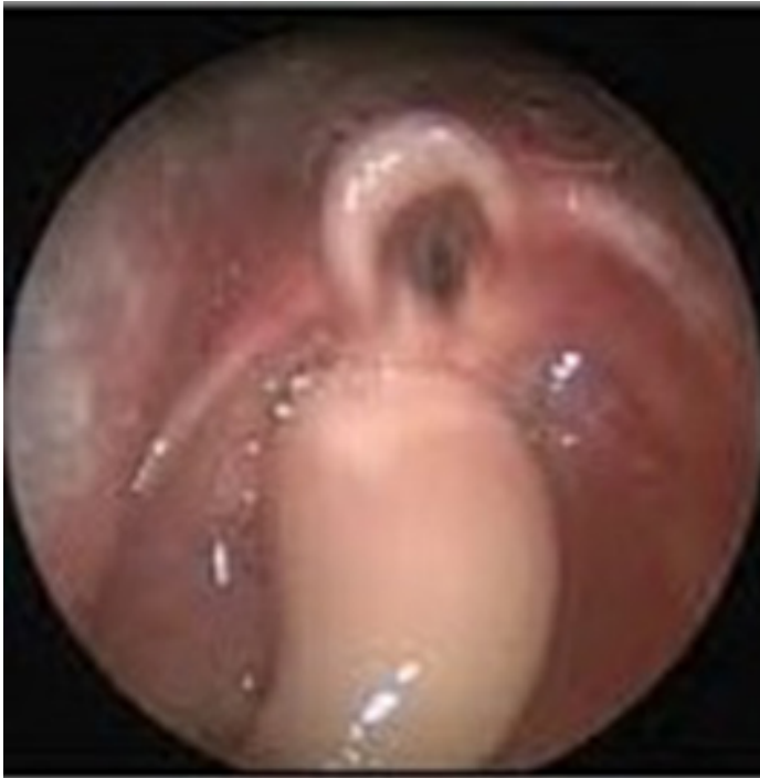
Figure 1. Endoscopic view of the angiofibrolipoma