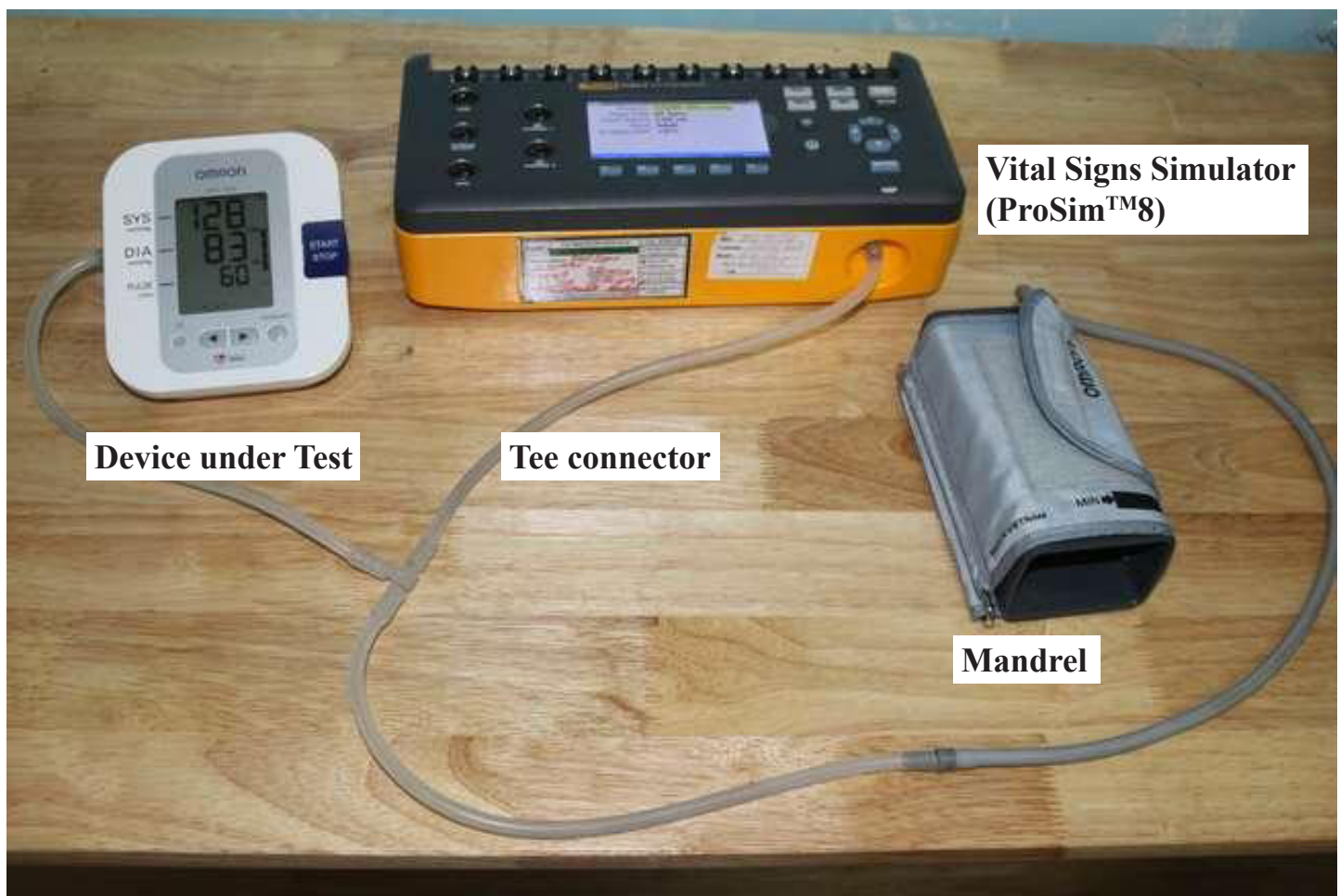
Figure 1. Set up of Blood Pressure Measuring Device for Pulse accuracy and leak tests with Vital Signs Simulator (ProSim™8), in health facilities of Bhutan, 2018 as per the standard operating procedure for performance verification and safety testing of blood pressure approved by the Ministry of Health for use in Bhutan

†The permissible range as specified in the standard operating procedure for performance verification and safety testing of blood pressure approved by the Ministry of Health for use in Bhutan